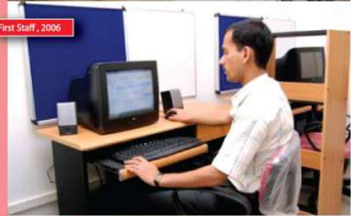
First Staff , 2006