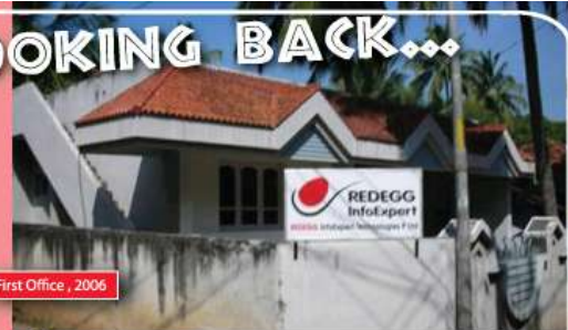
First Office , 2006