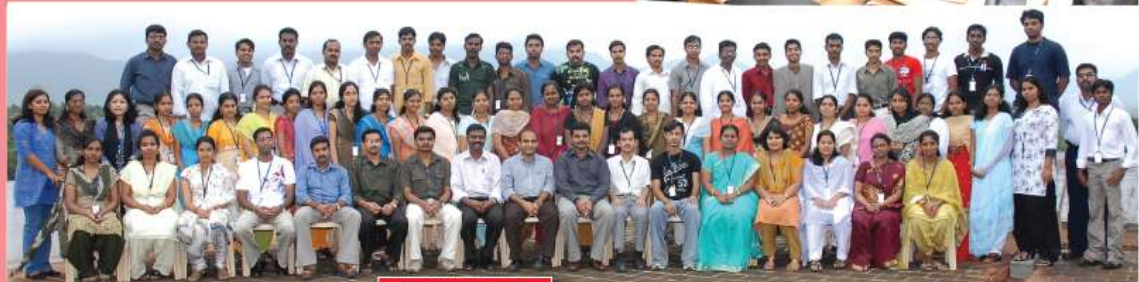
An era in the making...