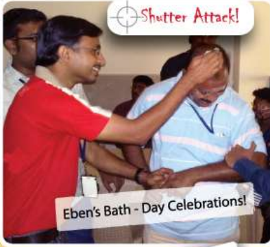
Eben's Bath - Day Celebrations!